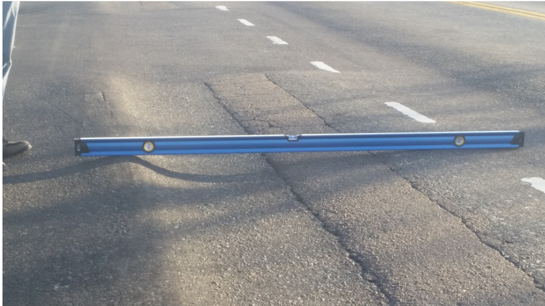
Washington St Southbound, north of South St. March 2016