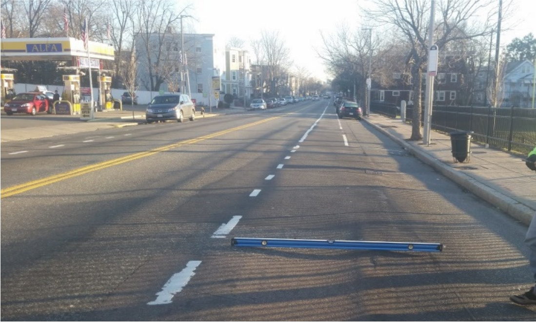
Washington St Northbound, north of Firth St. March 2016