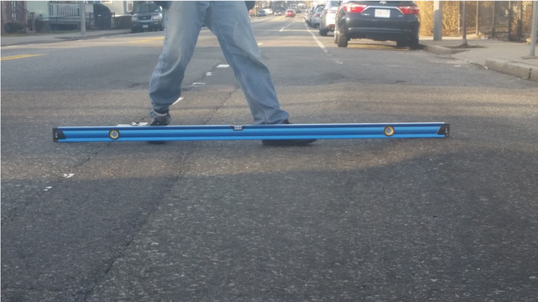
Washington St. Southbound, north of Granfield Ave. March 2016